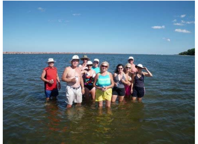
MBC'ers standing on Texas Rock