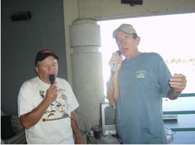
The birthday boys!