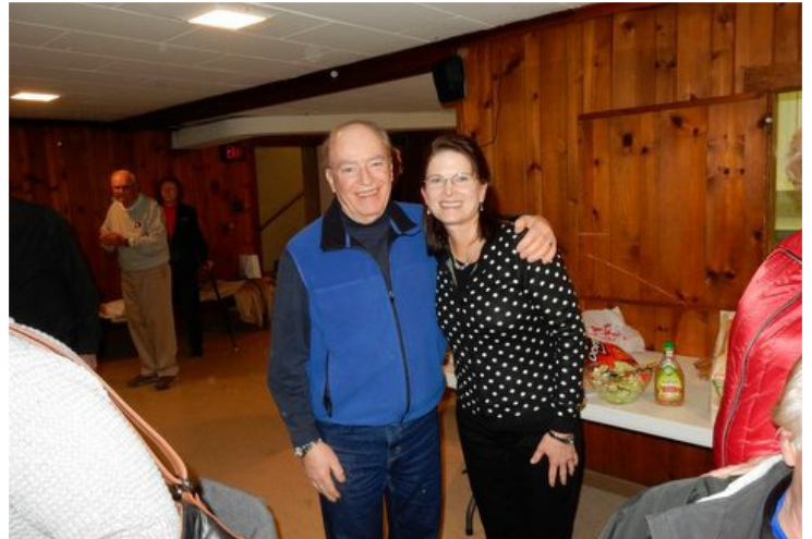
Grey & Cindy