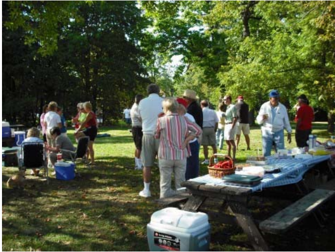
The gang's all here!