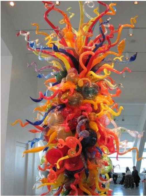
Milwaukee Art Museum Sculpture