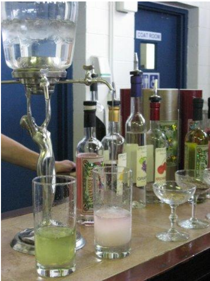
This is educational...really