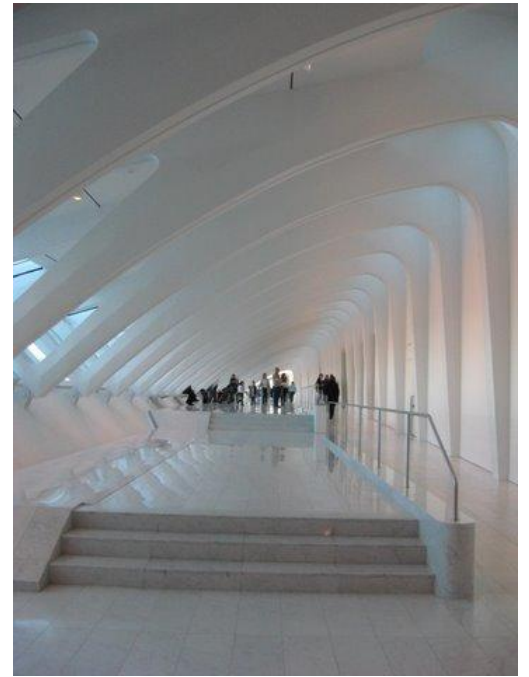
Milwaukee Art Museum