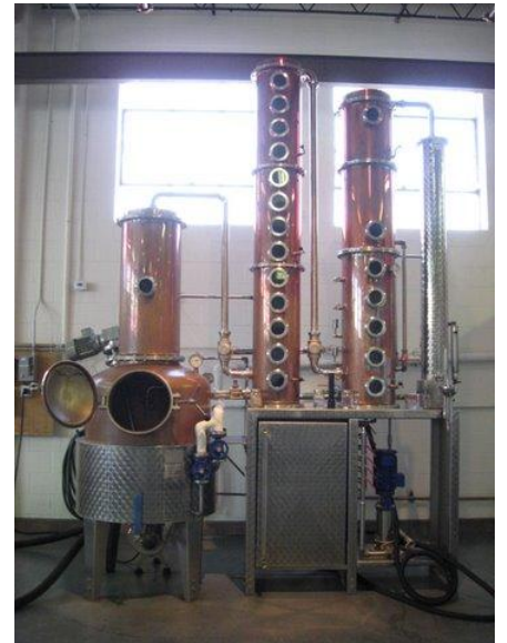
This is how it's all made