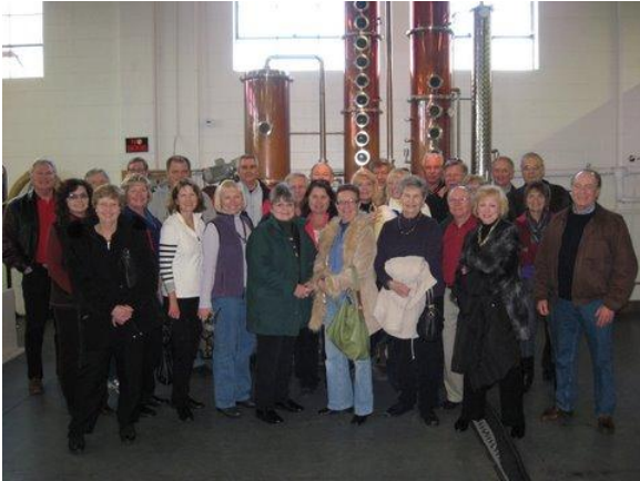
MBC members enjoying the Great Lakes Distillery tour