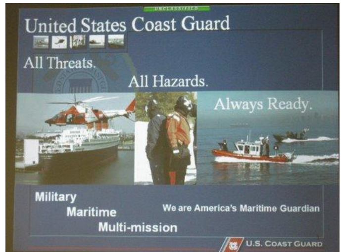
Slide from presentation