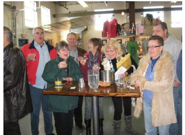
More taste testing