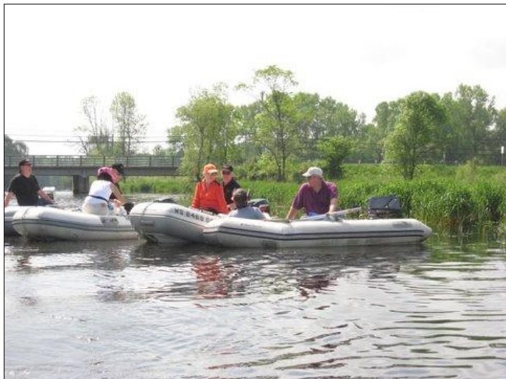
Getting ready to take off