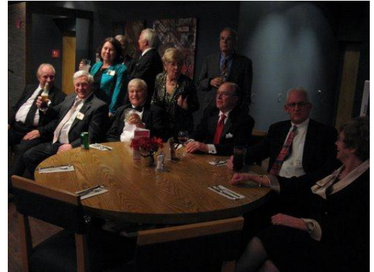
All dressed-up and watching Wisconsin beat Michigan State for the right to play in the Rose Bowl!