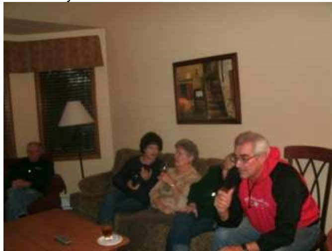
Watching the Badger game