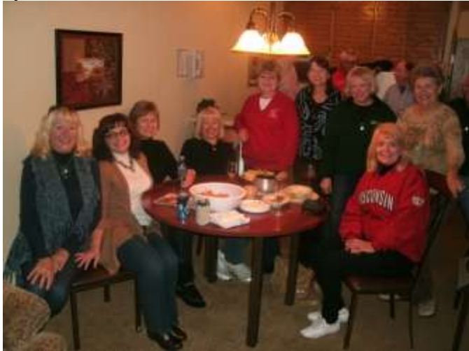
The ladies enjoying happy hour on Saturday