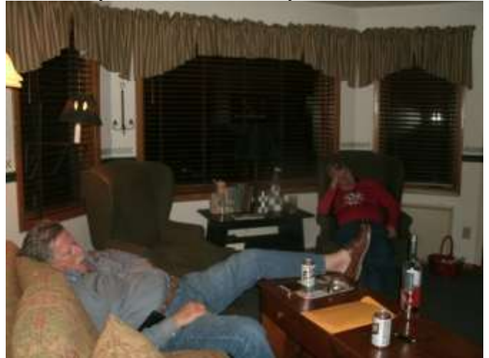
Was it an exhausting day!!!