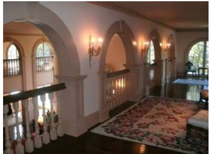
How about a mansion, 35 million!!!!