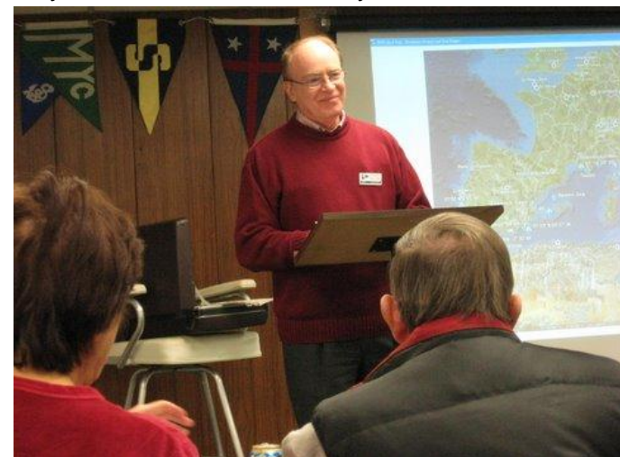
Commodore Grey Halstead